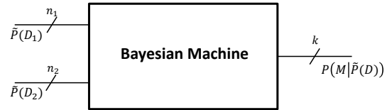
Fig. 1. Simple Bayesian Machine with two inputs and one output, and no free variables. The compilation toolchain takes a Bayesian program specification and uses ProBT to have a symbolic description of the computation used to synthesise the machine.

The ProBT software, developed by ProBAYES [11], enables an almost direct specification of Bayesian Programs such as the one defined above using C++ or Python bindings. This has allowed for the development of a compilation toolchain add-on to ProBT that transforms these bindings into VHDL that is then instantiated into a Bayesian Machine supported